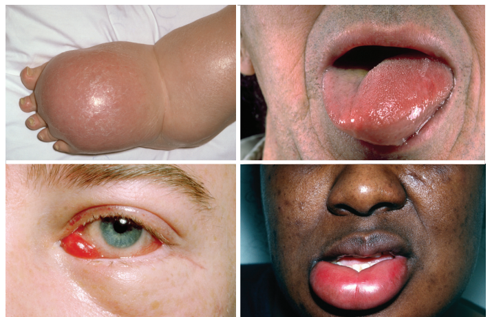
Edema shown above: Top left to right, Angioedema Foot and tongue, bottom left to right, Chemosis in Eye; Edema of lip

Capillary beds drain either through the venous or lymphatic system. Conditions obstructing drainage via either system, such as thrombophlebitis, chronic lymphangitis, surgical resection of regional lymph nodes, pressure from tumors (benign or malignant), or parasitic infestation such as filariasis, will result in lymphedema.